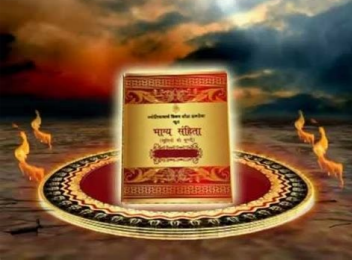
बृहत्संहिता का प्रथम संस्करण